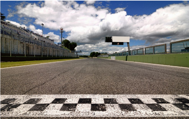
High-speed tests in Boxberg, Germany