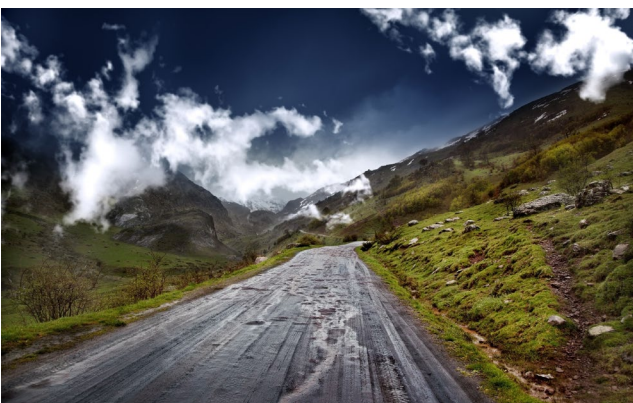
High-altitude tests at Pikes Peak, USA