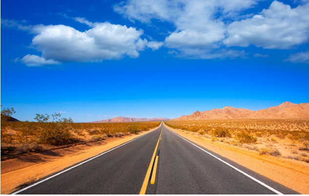
Hot environment tests in Death Valley, USA